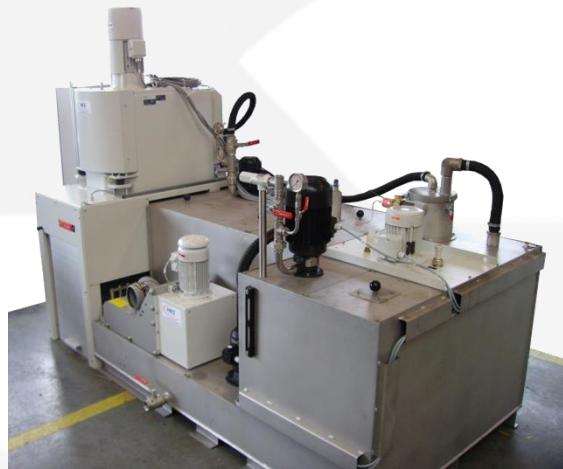
Centrifuge P 100 integrated in a complete cleaning system