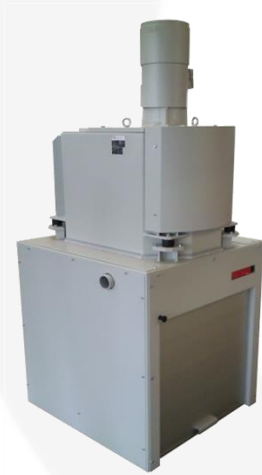
Centrifuge P 100

Solid-jacket Centrifuge for the Separation of Solids from Liquids